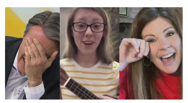
If you haven't seen this, it's one of my favorite pandemic videos (who would have ever thought that would be a sentence 4 months ago?). It sums up how many of us are feeling!