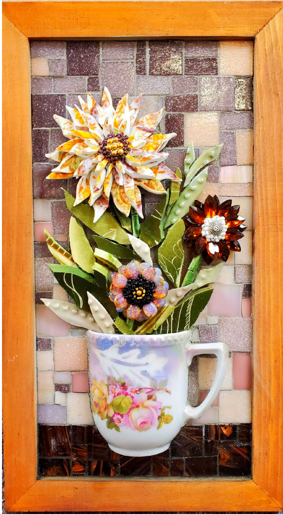
Such a fun class!