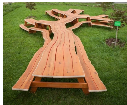
Picnic Table, carved from an entire tree